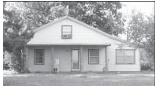
To view property before auction, please call Brink Auction Service, 580/335-4126

AUCTIONEER'S NOTE: If you have been looking for investment property, I encourage you to look this 37 acres and improvements over. Very close access to 2 casinos, Burkburnett or Wichita Falls, TX. Across the road from River Spring Addition that is developing every day. Choice location. Come prepared to invest. Your attendance will be appreciated by the Donnie Woods Estate & Brink Auction Service.